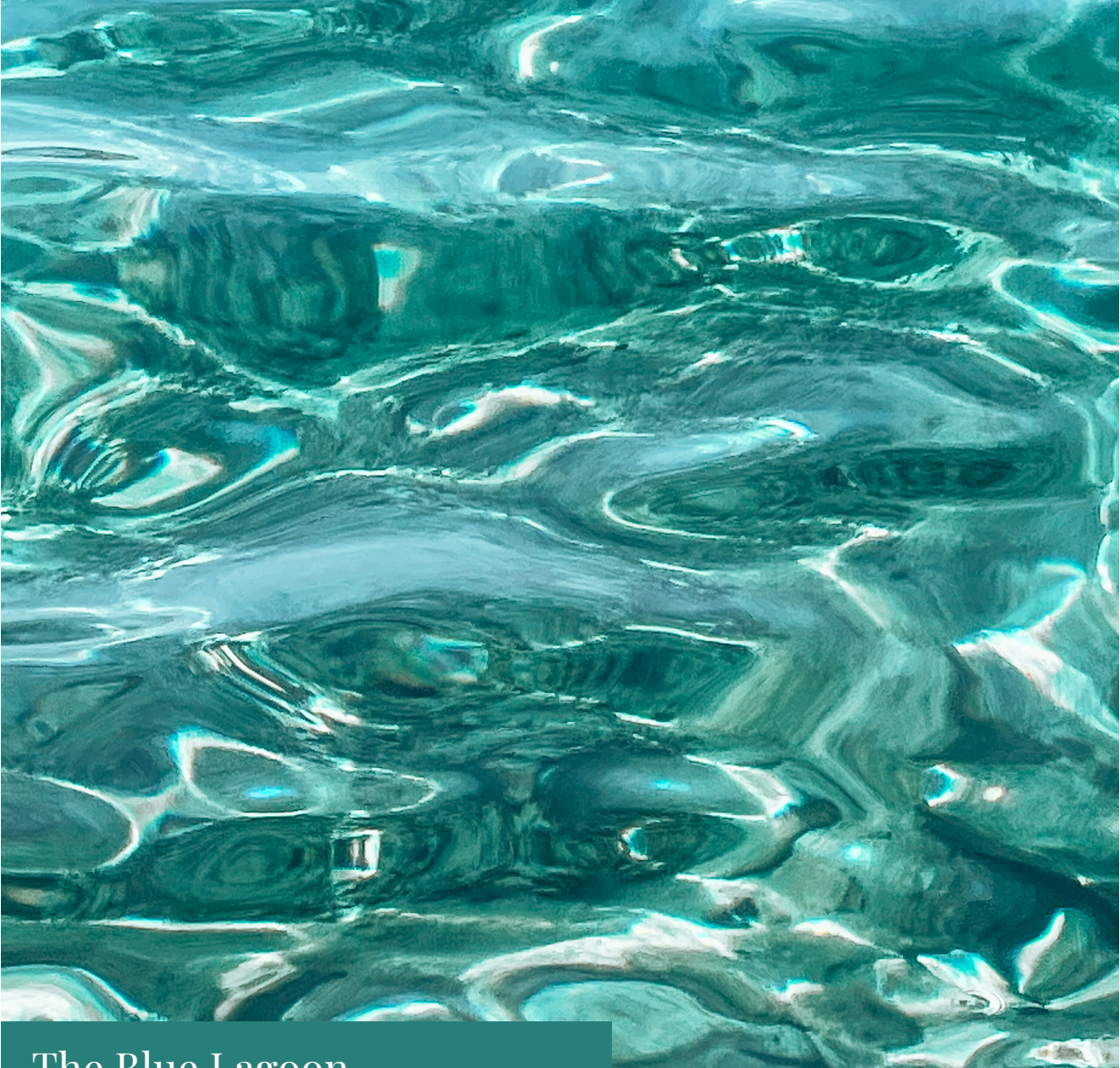
The Blue Lagoon